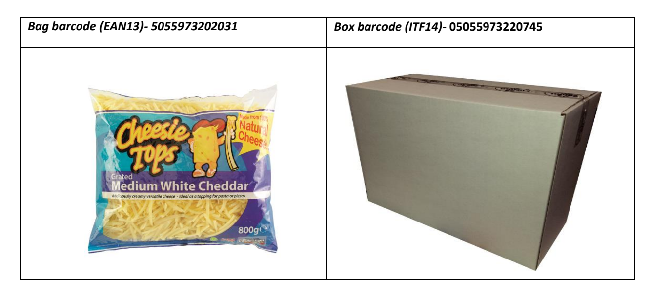
13. Box image

Manufacturing site address: Unit 3-4, New Cleveland Street, Hull, HU8 7AU