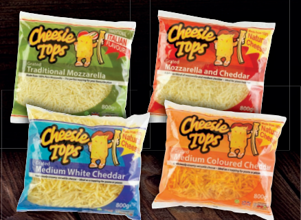
Cheesie Tops was formulated for a specific market. Excellent quality and a delicious taste. Cheesie Tops is ideal as an accompaniment for quick snacks.